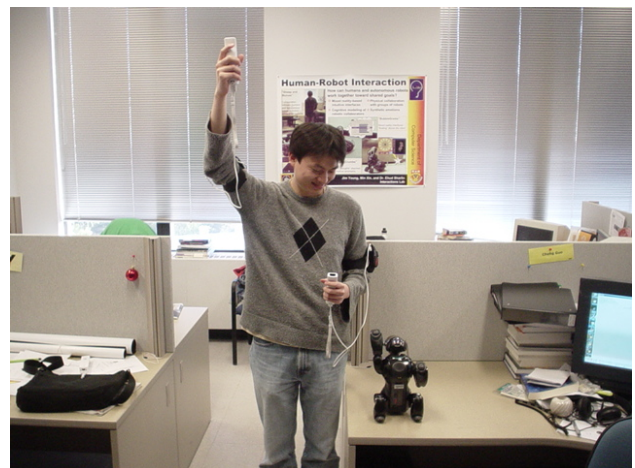
Figure 2. The user is controlling the AIBO to perform a posture using one Wiimote and one Nunchuk on each arm.

Due to the nature of the tasks, the Wiimote & Nunchuk gesture-to-action mappings deployed in each task differ from each other in terms of "degree of integration" and "degree of compatibility". [14] The interface mapping for the navigation task