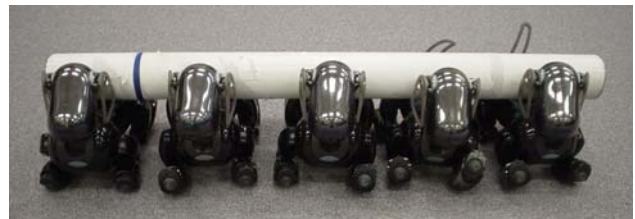
Figure 3. A conceptual design of a simple collaborative task among AIBOs carrying an object from one location to another.

To simulate a robot collaboration task in a lab setting, we intend to use five to eight AIBOs as the robotic platform for performing a set of collaborative tasks. For instance, the robots will be placed in a particular formation to carry or pull a heavy object together from one place to another. (Figure 3)