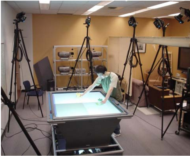
Figure 4. The user is holding two physical objects to interact with the virtual entities displayed on the SMART board. The board is surrounded with six Vicon motion tracking cameras for locating the reflective markers attached on top the objects to approximate their positions on the table.

may also build various ties in different shapes for accomplishing different tasks. On the other hand, by simply taking off a tie from a group of robots would break their group relationship. We hope this simple physical “binding” and “unbinding” metaphor would help users to organize multi-robot group behaviors easily.