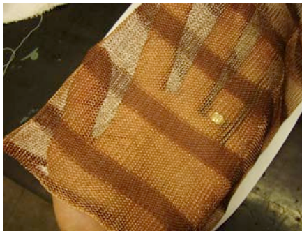
Figure 1. Example of Vertically Embedded Conductive Bands

To meet these goals, I have designed a custom-made fabric to be used as an enveloping interface for an installation space. This fabric prototype is knitted with non-conductive thread (PA, diameter of 0.20mm), and has conductive wire (tin copper, diameter of 0.10 mm) embedded on both its outer sides, horizontally on the one and vertically on the other, thus forming a conductive grid.