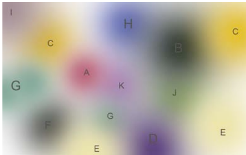
Figure 4. Example of Audio Interpolation Mapping

distinct textural area- the sound of all neighbouring nodes is interpolating with respect to their distance from the central node.