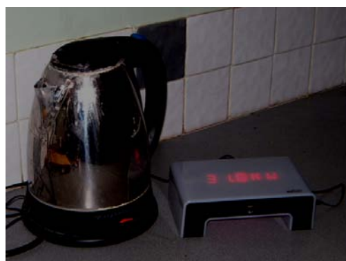
Figure 1. Wattson Device in a home setting

College of Art) and could be categorized as an ambient display [6]. The Wattson is shown in a domestic setting in Figure 1. The device can show instantaneous usage of electricity in kWatts or as an annual fee in UK £pounds. It also has a series of LEDs embedded in its base which emit an ambient colour based on current usage (such as blue for low usage). Users of the Wattson can optionally choose to use a piece of software which logs their usage and presents it via visualisations. Furthermore, users can also choose to upload their usage statistics to the Kyoto website and make it publicly available to other users. Although the take-up of this functionality seems limited (based on casual observation of forums on the DIY Kyoto website) it is a step towards the persuasive use of such technology as it promotes awareness of other people's usage as well as one's own.