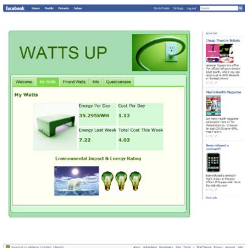
Figure 2. User's view of their hypothetical energy usage once they install Watts Up in their Facebook profile.

evaluated in an academic context for this purpose remain very limited.