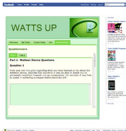
Figure 4. Questionnaire embedded in Facebook Application.

The questionnaires used in the study were embedded into the Watts Up application, with the user being able to complete and submit their answers from within their Facebook account. This provided a more integrated solution for capturing the data as the user will have viewed the features in Watts Up directly before commencing the questionnaire. A screenshot of the questionnaire embedded within Watts Up and the users Facebook account is seen in figure 4.