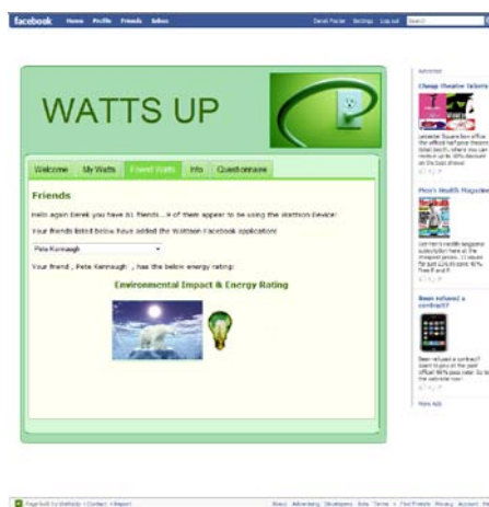
Figure 3. User's view of their friends' hypothetical energy usage in the Watts Up application.

functionality. The intention was to provide viewpoints for possible re-design elements to potentially improve the concept of energy awareness in the home.